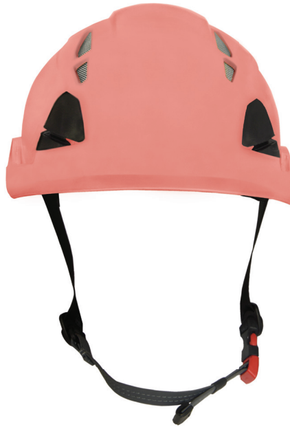
(Front with Chin Strap)