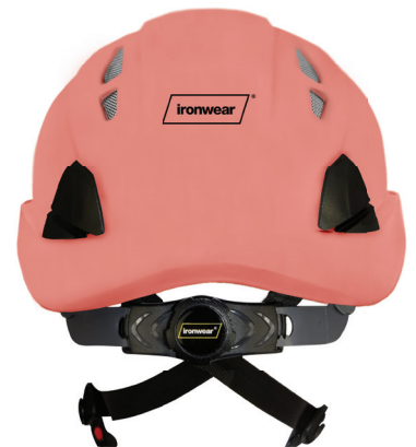
(Back with Ratchet)